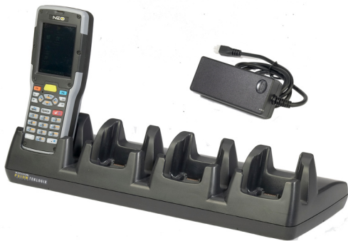
Figure 2.0 PX3004 Quad Docking Station and Power Adapter

The PX3004 Quad Dock and Charger with Power Adapter (Figure 2.0) is a desktop model designed to accept as many as four NEO terminals. The PX3004 station powers the docked NEO terminals and their internal battery charger. The PX3004 also connects a 10/100 Base-T Ethernet network to the docked NEO terminals.