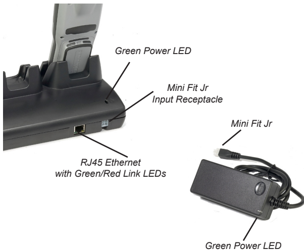
Figure 3.1 Quad Docking Station Rear View and Power Adapter

! Important: The Ethernet connection is for indoor use only.